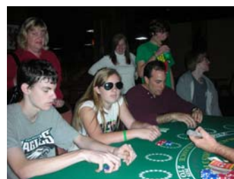
A little blackjack