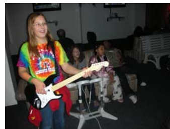
Jammin' in the Wii Room