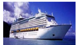
The Explorer of the Seas