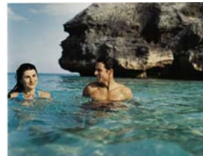
Swimming in Horseshoe Bay