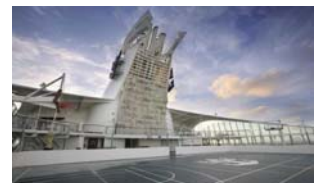
Rock Climbing On Board