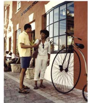
Shopping in Bermuda