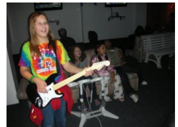
Jammin' in the Wii Room