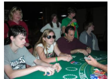
A little blackjack