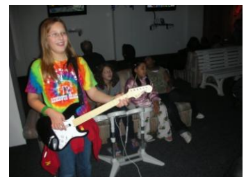
Jammin' in the Wii Room