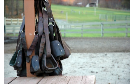
Ready To Hit The Trails