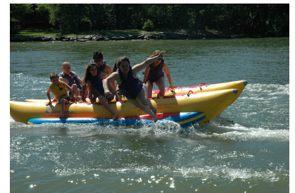
Banana Boating On The Lake